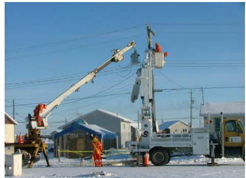
Skilled First Nations Trades Staff at Work in Attawapiskat (December 2008)